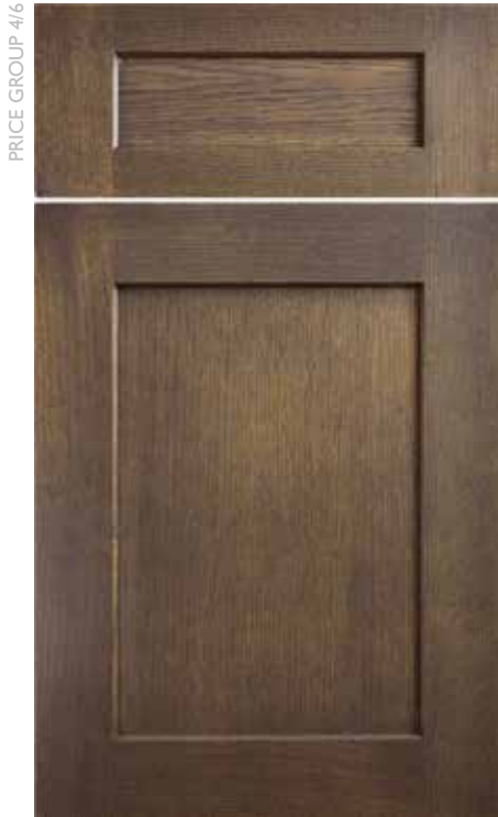
Carson Shown in Quarter Sawn White Oak, Morel A•C•H•M•O•P•Q