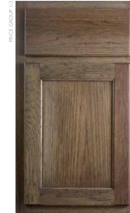
Campbell Shown in Hickory, Morel A•C•H•M•O•P•Q