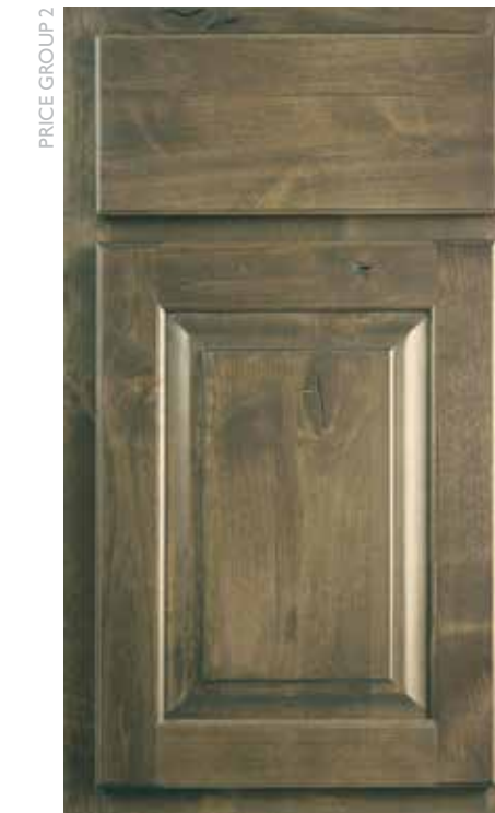
Porter Shown in Knotty Alder, Morel A•C•H•M•O•P•Q