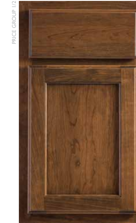
Oxford Panel Shown in Cherry, Cappuccino A•C•H•M•O•P•Q