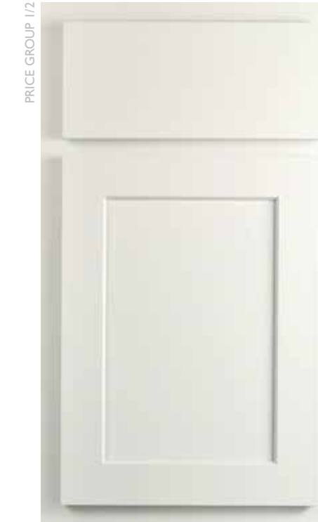
Nolan Shown in Paintable, Dove Paint A•C•H•M•O•P•Q