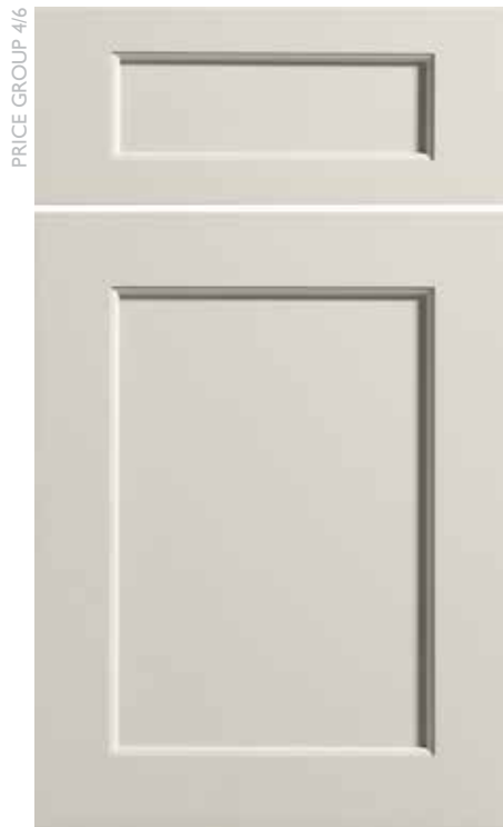
Highland Shown in Paintable, Canvas Paint A•C•H•M•O•P•Q