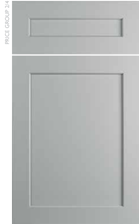
Hudson Shown in Paintable, Zinc Paint A•C•H•M•O•P•Q