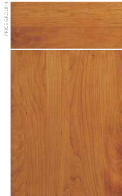
Camden Shown in Cherry, Harvest A•C•H•M•O•P•Q