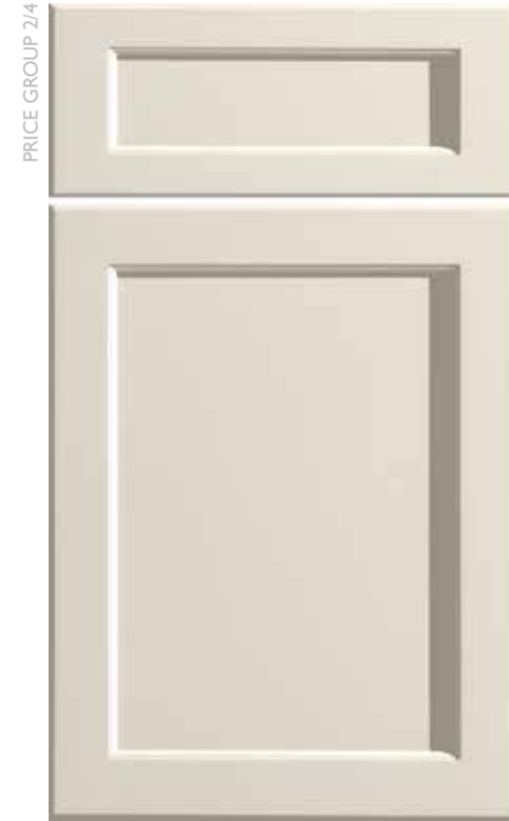
Kendall Panel Shown in Paintable, Putty Paint A•C•H•M•O•P•Q