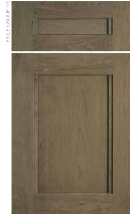
Avery Shown in Cherry, Cashew A•C•H•M•O•P•Q