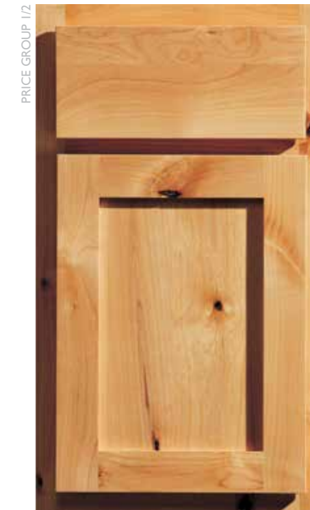
Santa Fe Panel Shown in Knotty Alder, Natural A•C•H•M•O•P•Q