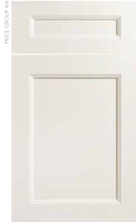
Meridien Shown in Paintable, Linen White Paint A•C•H•M•O•P•Q