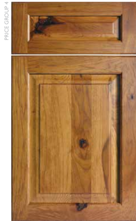
Kendall Shown in Rustic Hickory, Butternut A•C•H•M•O•P•Q