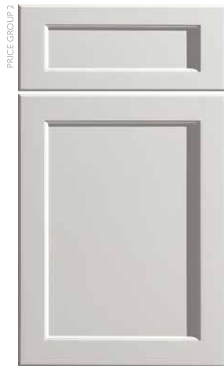
Kendall Panel Shown in Paintable, Pearl Paint A•C•H•M•O•P•Q