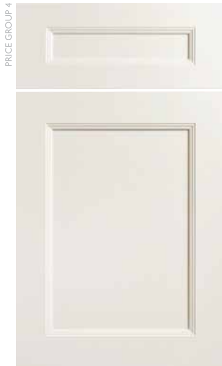
Meridien Shown in Paintable, Linen White Paint A•C•H•M•O•P•Q