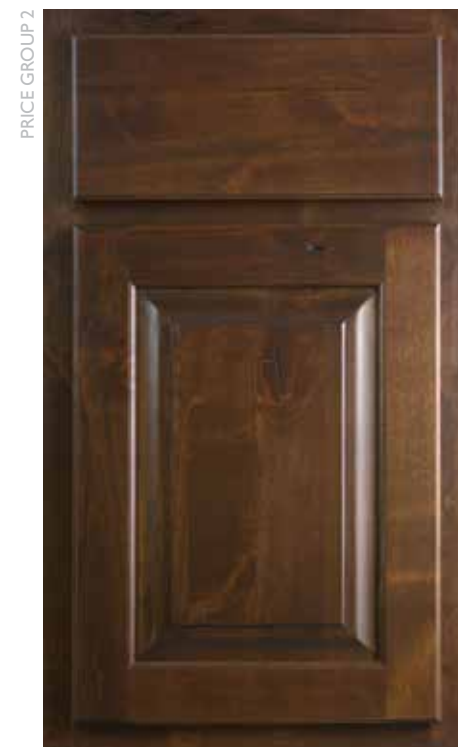
Porter Shown in Knotty Alder, Hazelnut A•C•H•M•O•P•Q