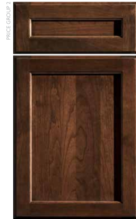
Arcadia Panel Shown in Cherry, Mocha A•C•H•M•O•P•Q