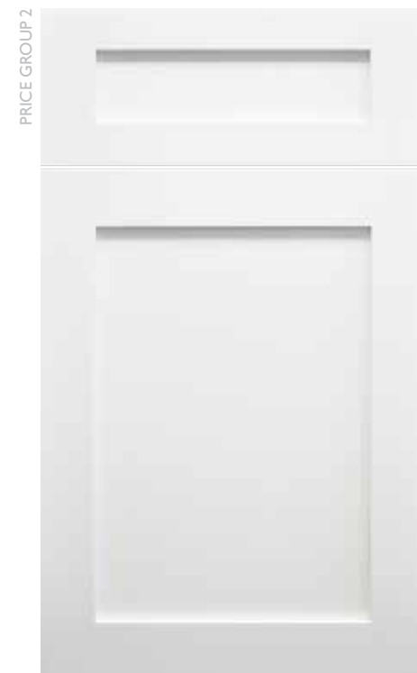
Homestead Panel Shown in Paintable, White Paint A•C•H•M•O•P•Q