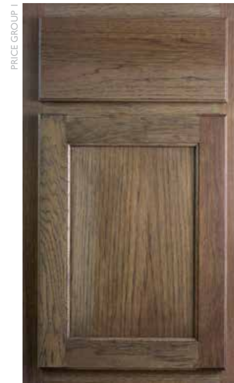
Campbell Shown in Hickory, Morel A•C•H•M•O•P•Q