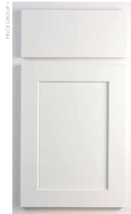
Nolan Shown in Paintable, Linen White Paint A•C•H•M•O•P•Q