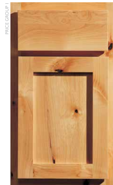
Santa Fe Panel Shown in Knotty Alder, Natural A•C•H•M•O•P•Q