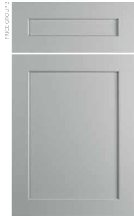
Hudson Shown in Paintable, Zinc Paint A•C•H•M•O•P•Q