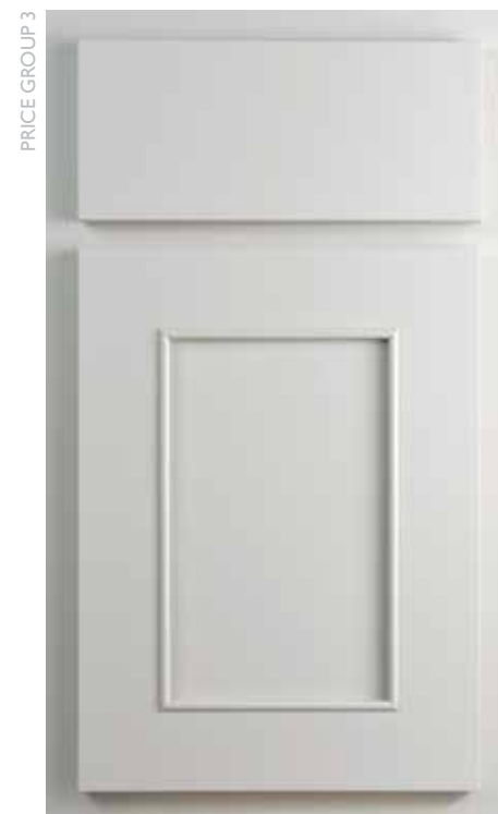
Sierra Shown in Paintable, Pearl Paint A•C•M•P